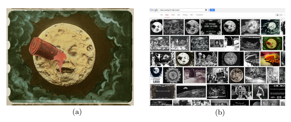
Fig. 1. (a) Search example for a movie, for which the user has only a visual memory and does not know title, director, or actor information. (b) Result of an image search experiment with descriptive terms "Moon, Landing, Hit, Silent Movie".

research. But, search engines help the user to find a solution for her information needs only as long as the user knows how to phrase the search query. If the user lacks the knowledge to name the document or entity she is looking for, maybe because she is not familiar with the pertaining subject, web search engines are only of limited use. Imagine the following scenario: You are looking for a distinct movie, but you don't know the title or neither the director or any of the actors. But, you have an iconic picture in your mind which is part of that movie and is depicted in Fig. 1(a)^5 .